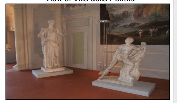
Villa Corsini: the Antiquarium

This trail is packed full of history, art and beautiful landscapes. featuring many suburban holiday villas that are renowned for their beauty, historical importance and grandeur: the Medici Villas of Castello and Petraia, with their magnificent Italian gardens (not just in terms of their geometric perspectives, but as metaphors and symbolism for the power and prestige of the Prince) as well as the Villas that used to belong to the Medici, such as Villa Corsini and Villa La Quiete alle Montalve, where the Electress Palatine, Anna Maria Luisa de' Medici, lived from 1724, the last descendant of the family. This area, partly extending up Quarto hill, gets its name from the ancient Etruscan and Roman village (Castellum, meaning a cistern, or a water tank) which contained part of the aqueduct built by Senator Marcus Opellius Macrinus (164-218) that was used to send water towards Florence. The Medici chose this region for their 'otium' and other delights; it was the scene of many key events in the family's history. Even though the area downstream has been overrun by urban development, it still maintains the exact same extraordinary history, which has also been created through the walled roads and alleys enclosing parts of the countryside, ancient farmhouses, olive groves and farmsteads. These features bear witness to the region's agricultural past that was based on a sharecropping system, proof of which is found all around us with its distinctly rural network.