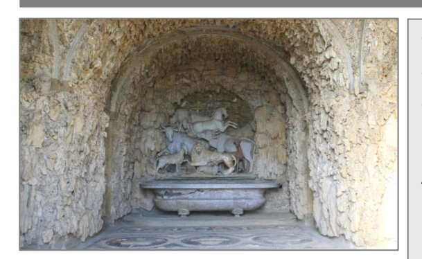
Villa di Castello: the Grotto of Animals