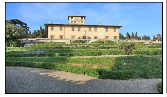
View of Villa della Petraia