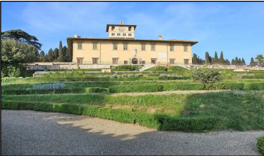
View of Villa della Petraia