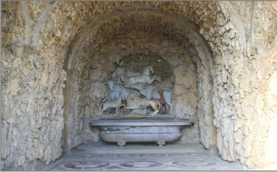
Villa di Castello: the Grotto of Animals