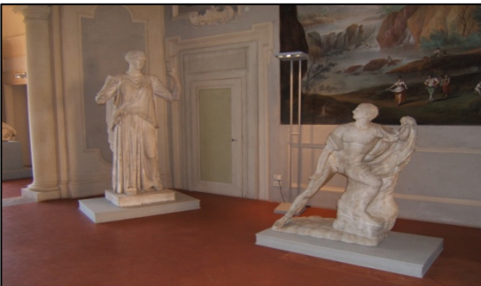
Villa Corsini: the Antiquarium

This trail is packed full of history, art and beautiful landscapes, featuring many suburban holiday villas that are renowned for their beauty, historical importance and grandeur: the Medici Villas of Castello and Petraia, with their magnificent Italian gardens (not just in terms of their geometric perspectives, but as metaphors and symbolism for the power and prestige of the Prince) as well as the Villas that used to belong to the Medici, such as Villa Corsini and Villa La Quiete alle Montalve, where the Electress Palatine, Anna Maria Luisa de' Medici, lived from 1724, the last descendant of the family. This area, partly extending up Quarto hill, gets its name from the ancient Etruscan and Roman village (Castellum, meaning a cistern, or a water tank) which contained part of the aqueduct built by Senator Marcus Opellius Macrinus (164-218) that was used to send water towards Florence. The Medici chose this region for their 'otium' and other delights; it was the scene of many key events in the family's history. Even though the area downstream has been overrun by urban development, it still maintains the exact same extraordinary history, which has also been created through the walled roads and alleys enclosing parts of the countryside, ancient farmhouses, olive groves and farmsteads. These features bear witness to the region's agricultural past that was based on a sharecropping system, proof of which is found all around us with its distinctly rural network.