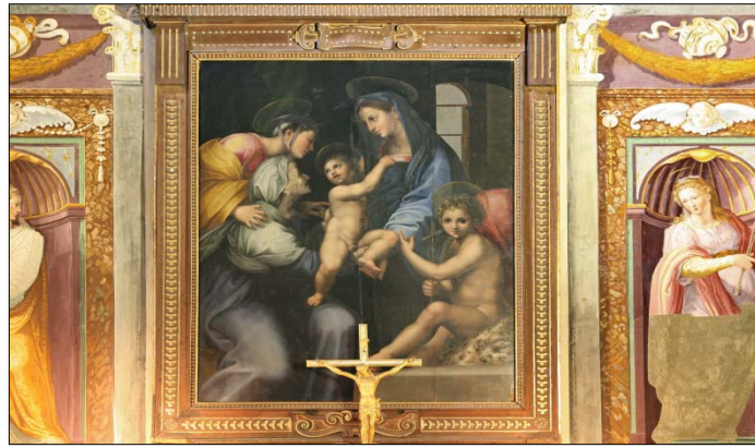
The Old Chapel, a copy of Raphael's Madonna dell'Impannata