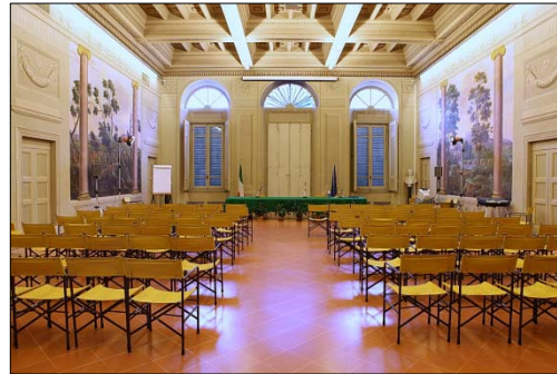
One of the interiors