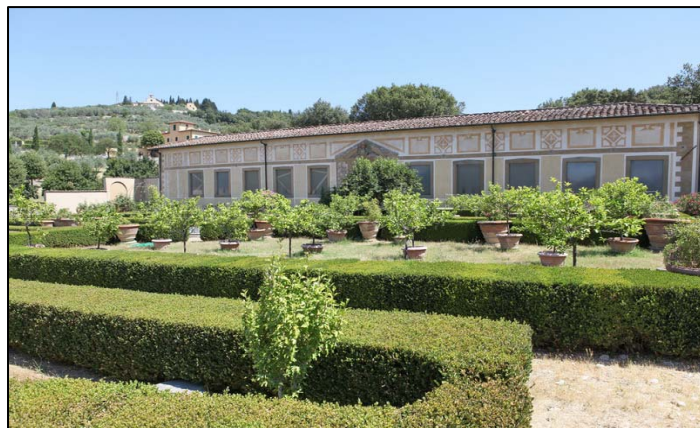
Villa il Pozzino, the gardens