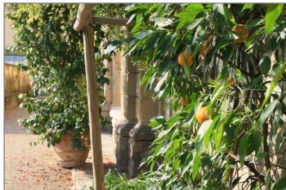
The Citrus Garden

Villa Reale di Castello - Also known as Villa del Vivaio (since there used to be fish tanks where the semicircular grassy square now stands), this villa is surrounded by one of the first and most extraordinary Italian gardens which Tribolo ever built for Cosimo I de' Medici (it had been in the family's possession since 1480, when Lorenzo and Pierfrancesco bought the 14 th century villa from the Della Stufa family). It became the model and source of inspiration for all the garden art to come (the Boboli Gardens by Tribolo in Florence trace back to this work). It is formed of three terraces sloping towards the back of the villa. One almost seems like an extension and is divided into 16 flowerbeds with the sculpture "Hercules and Antaeus" by Bartolomeo Ammannati in the centre (now replaced with a copy). The second terrace (known as the "Citrus Garden") has an amazing collection of 500 rare and precious varieties of citrus trees, created by grafts and experiments on all the species known since the times of the Medici. While the third terrace features the "Grotto of Animals", a masterpiece of mannerist art by