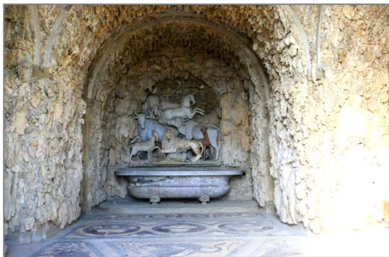
The Grotto of Animals, by Tribolo