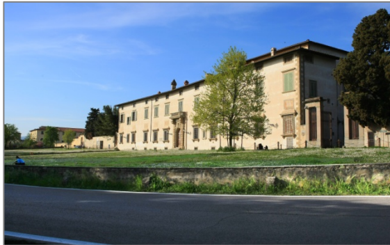
The façade of Villa Reale di Castello

Near to the border with Sesto Fiorentino, we turn off Via Reginaldo Giuliani and head down Viottolone del Vivaio (which is now part of the Mario Luzi Park , named after the great poet who died in 2005). At the end of this street, we see Villa Reale di Castello towering dramatically over Piazza delle Lingue d'Europa .