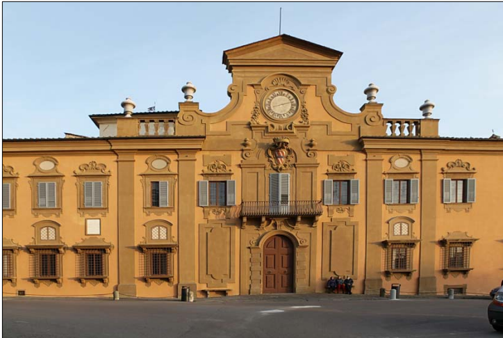
View of the façade of Villa Corsini

We take a right from the Villa onto Via Accademici della Crusca before turning right again onto Via di Castello . From here, we once again turn right onto Via della Petraia . At the crossroads between these two streets, we suddenly see the dramatic Baroque façade of Villa Corsini .