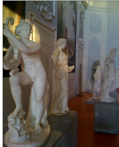
Statues in the antiquarium