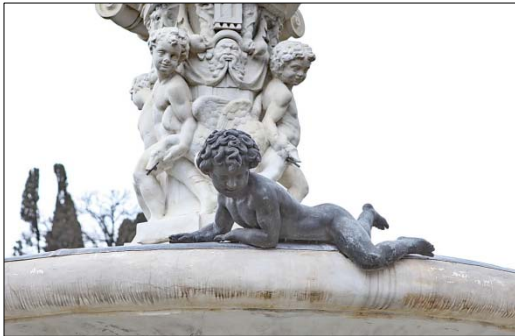
Part of the Hercules and Antaeus Fountain (a copy)