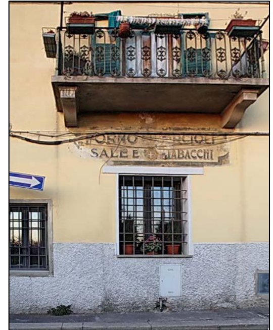
The old Quercioli Bakery - Salt and Tobacco, on Via di Boldrone, nowadays a private residence