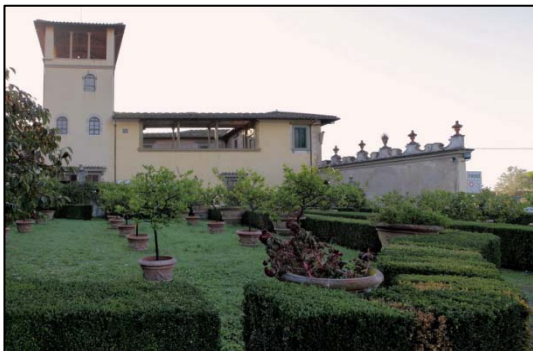
Villa Il Pozzino

From here we take Via Giovanni da San Giovanni , where at No. 12 we are faced with Villa Il Pozzino .