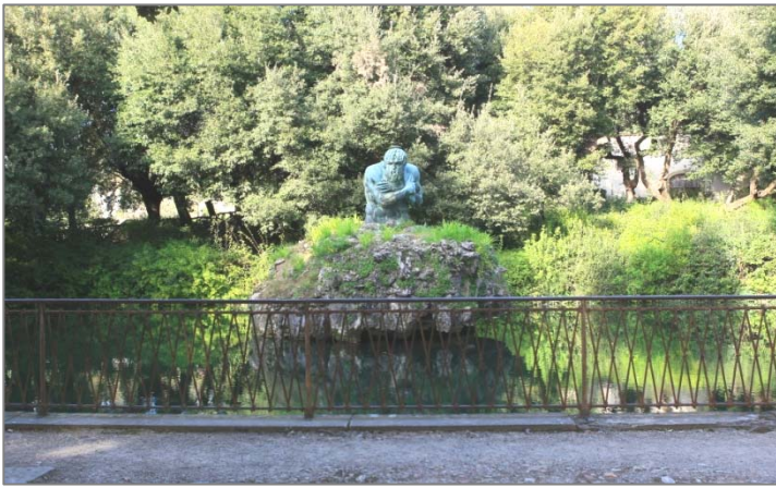
The statue of "Appennino" by Bartolomeo Ammannati