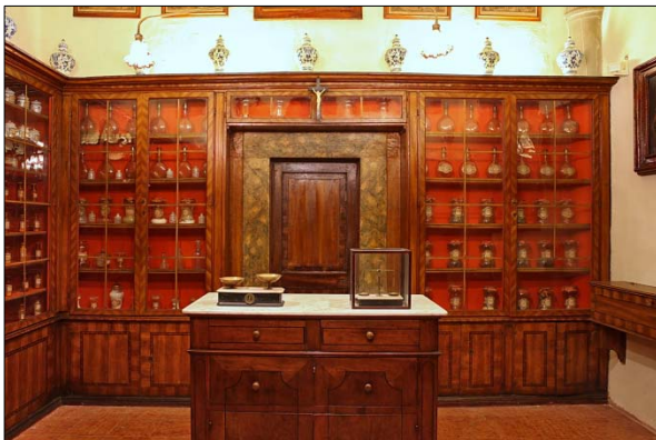
The ancient apothecary