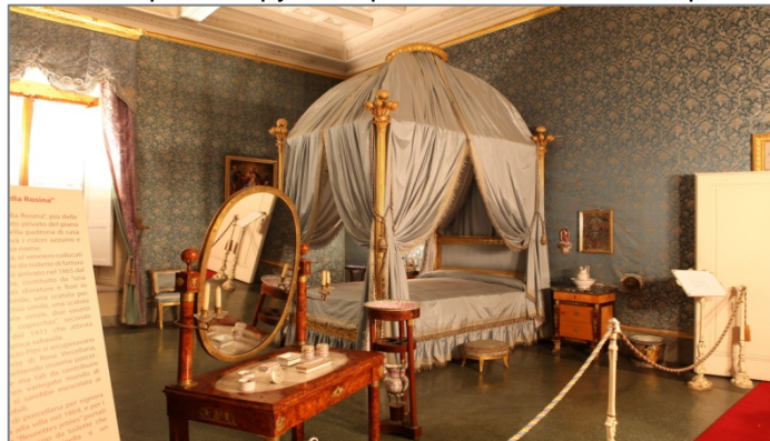
The Bella Rosina bedroom

The villa's courtyard is decorated with extraordinary cycles of paintings (including "Moments of Glory of the Medici family" by Volterrano), which were commissioned by Don Antonio de' Medici in 1609. It houses a priceless art gallery collected by Don Lorenzo de' Medici, however, the villa gradually fell into disrepair until the Lorraine family took over. During this time, they moved Tribolo's statue of Venus-Fiorenza from Villa di Castello to the garden at Petraia. The villa was then passed on to the Savoy family, who compiled an inventory in 1911 of all the furnishings, which was used to recreate the modern museum. In 1919, it was donated to the Italian State which gave it to the Opera Nazionale Combattenti (National Veterans' Association), but it was returned to the State in 1960. Since 1984, when the National Museum was established, there has been a slow and complex restoration process to recover parts of the structures and the furnishings.