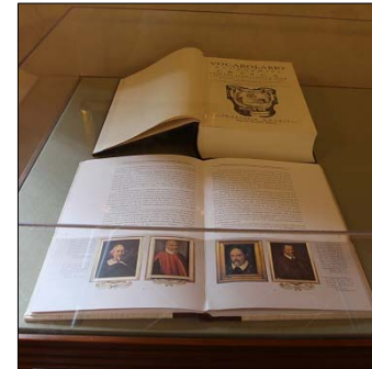
The Crusca dictionaries