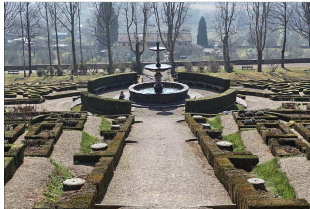
View of the garden's central axis

Villa La Petraia Dating back to the 14 th century, this villa once belonged to the Brunelleschi, Strozzi and Salviati families. It was bought in 1544 by Cosimo I de' Medici. In 1588, under Grand Duke Ferdinando it underwent major renovation work, which involved the entire hill (which was very stony, hence the name Petraia) being excavated and transformed into a beautiful series of terraces overlooked by the villa. The villa itself was restructured around the 14 th century central tower, which was converted into a panoramic viewpoint. Unlike Villa di Castello, which was mainly used for entertaining, Petraia was an actual residence. As such, we find plants that could be used and very few statues or fountains.