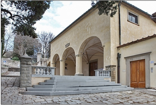
The Church of S. Michele a Castello as seen from Via della Querciola

We take left from Via della Petraia , heading down Via S. Michele a Castello , where we find the Church of San Michele a Castello .