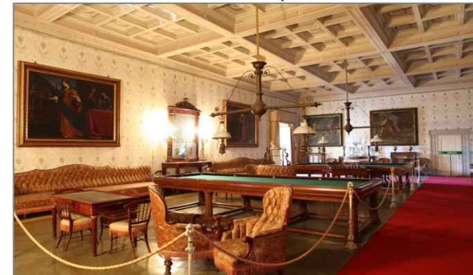
The games room