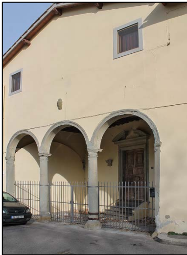
Façade of the Monastery of S. Giovanni Evangelista di Boldrone

The Monastery of Boldrone was then abolished by Napoleon's government and sold to private owners who converted it into residential buildings. Sadly nowadays, it is difficult to see the original purpose of the building.