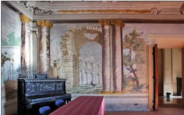
The interior decorated with frescoes