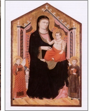
Pacino di Bonaguida