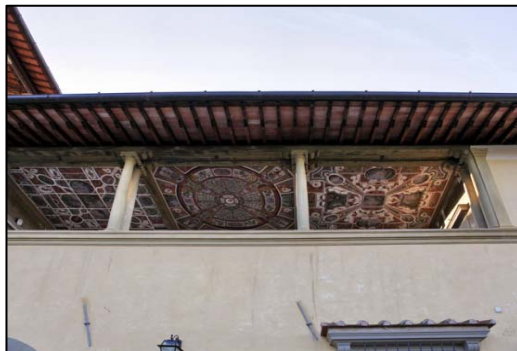
Villa Il Pozzino, the loggia