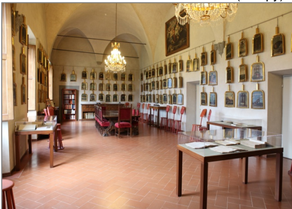
The Accademia della Crusca in the Sala delle Pale (the Hall of Shovels)