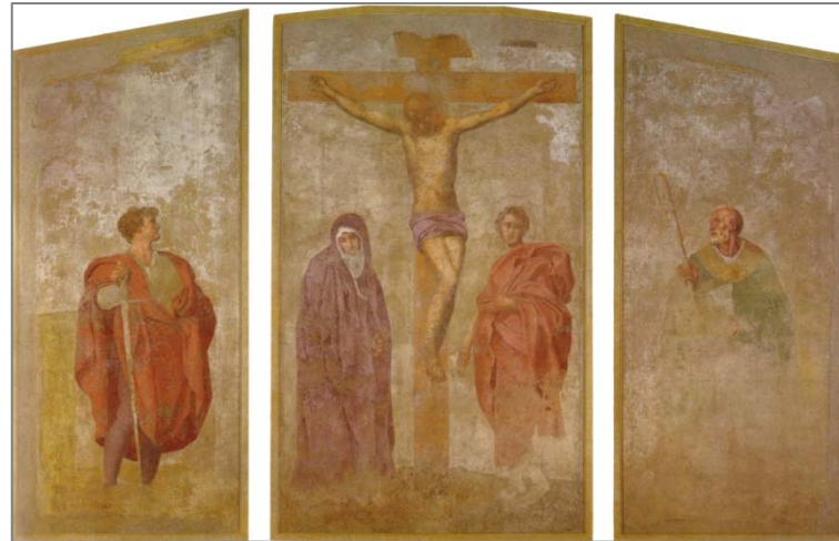
Frescoes by Pontormo that have been detached and are now kept at the Academy of Art and Design

As we continue along Via di Boldrone, we find the Monastery of S. Giovanni Evangelista di Boldrone