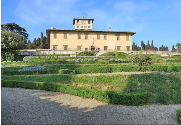
View of the front of Villa La Petraia

We now turn right onto Via della Quietè and then left onto Via Dazzi . We then take another left, heading down Via del Gioiello . We stay on this road until we take another left onto Via dell'Osservatorio . Once we've strolled down the first section, we turn right to head down Via di Boldrone . At the end of this road, we bear to the right onto Via della Petraia , where we find the beautiful Villa La Petraia .