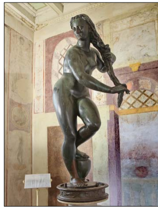
Venus by Giambologna