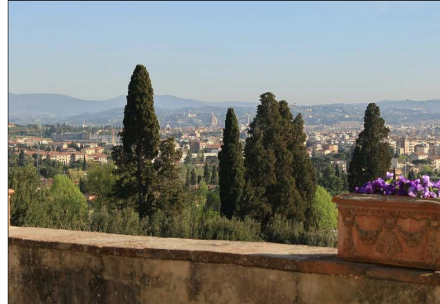
The panorama from the terrace in front of the Villa