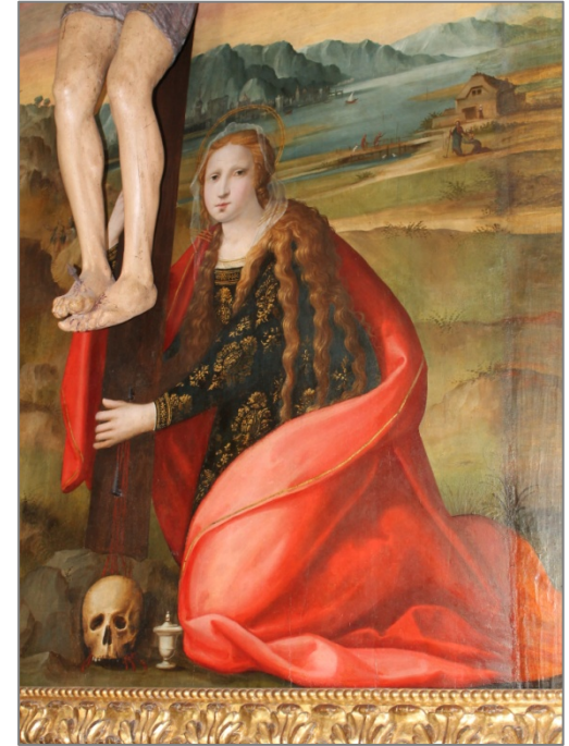
Ridolfo del Ghirlandaio and Michele di Ridolfo, part of "Magdalene and Dominican sister"

Villa La Quiete alle Montalve - This ancient noble home used to belong to the Orlandini family, then to Niccolò da Tolentino and finally the Medici. It had its greatest moment of splendour in the 17 th century under Christina of Lorraine, before it was passed on to Eleonora Ramirez de Montalvo, who used it as a school for young noble girls in the mid-17 th century. The Church and the parlours (once used as the rooms of noble guardians, facing the garden behind the Church) house many masterpieces (by Giovanni della Robbia, Ridolfo del Ghirlandaio, Baccio da Montelupo, Neri di Bicci and others), as does the gallery on the top floor (including the fresco by Giovanni da San Giovanni "Quiet calming the winds" which gives its name to the villa). There is a beautiful Italian garden to the south which slopes towards the plains and is surrounded by high walls with several niches. It took the fancy of Anna Maria Luisa de' Medici (the Electress Palatine), the last descendant of this family, who chose the villa as her residence in 1724. Notably, the garden has almost managed to retain all of its original 18 th century features and, in particular, the ragnaie (nets hung in between trees to catch birds) which were usually taken down. The ancient apothecary is also very interesting. It has been kept exactly how it was in the 17 th century, featuring albarellos and glass containers with interesting samples of spices and herbal remedies.