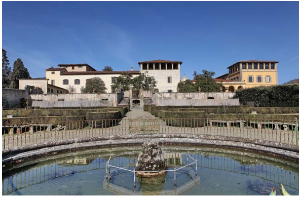
View of Villa La Quiete from the centre of the garden