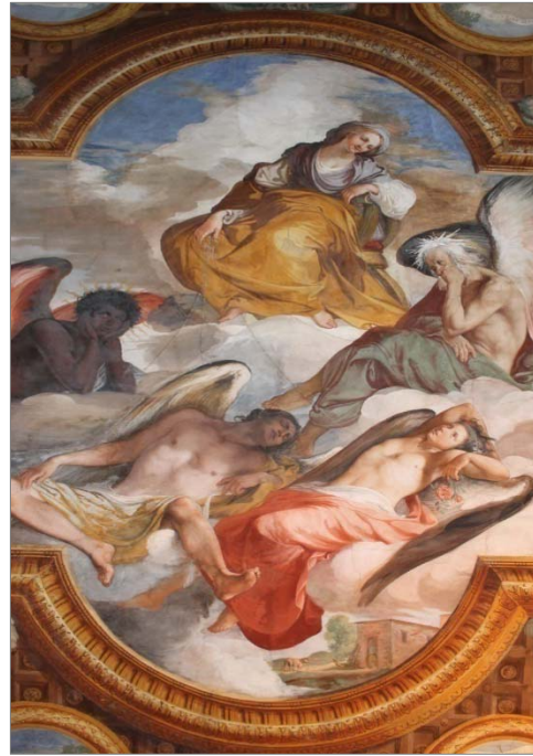
Giovanni da S. Giovanni, "Quiet calming the winds" (1633)