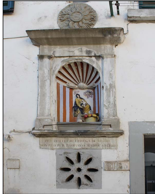
No. 19, Via dell'Osservatorio, a short prayer for the month of Mary ("Pray to the Lord for all the guilty, but alas, oh Mother, I am guilty too")