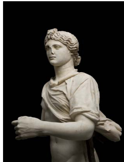
Apollo "the archer", Roman sculpture