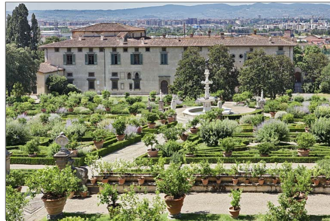
View of the Villa's façade from the Garden