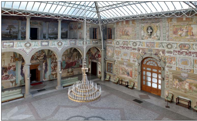
The courtyard featuring frescoes by Volterrano