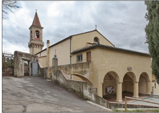
To the left, the secondary gate of Villa Reale di Castello