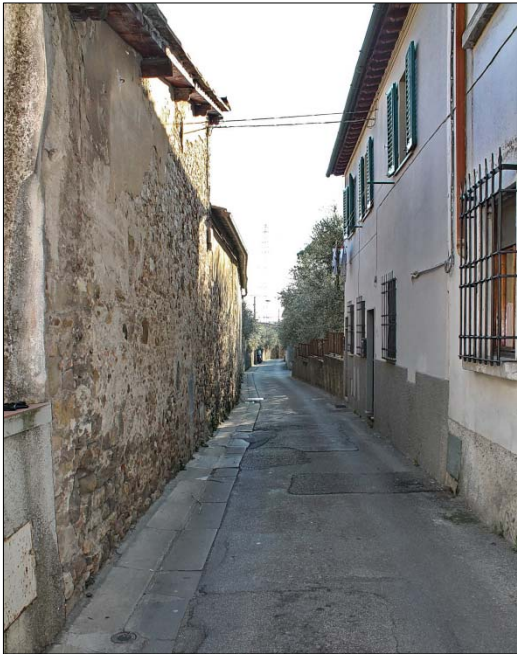
Via dell'Osservatorio in between ancient houses and the countryside

This is also a typical example of an ancient Tuscan rural lane (with dry-stone walls, villas, noble homes and farmers' quarters), bearing witness to this area's agricultural traditions which, like almost everywhere in Tuscany, were based on a sharecropping system. This feature will become all the more evident during the section which climbs up to Quarto (see the connected trail). As we stroll down Via dell'Osservatorio (at No. 19 there's a recess in the wall to one of the ancient workers' homes, which contains a Madonna with Child and an engraved prayer) we reach the crossroads between two streets. We take a right down Via di Boldrone , which features the tabernacle of the same name that once held three frescoes by the great Pontormo (they have now been moved to the Academy of Art and Design). There is a private home nearby featuring an ancient sign for an old bakery.