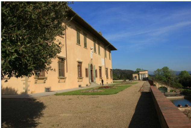
The façade with the Réposoir in the background