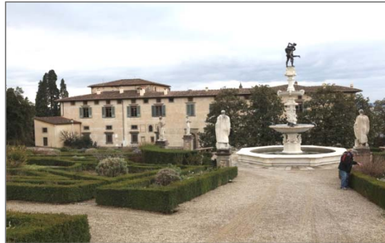
Hercules and Antaeus, by B. Ammannati (copy)