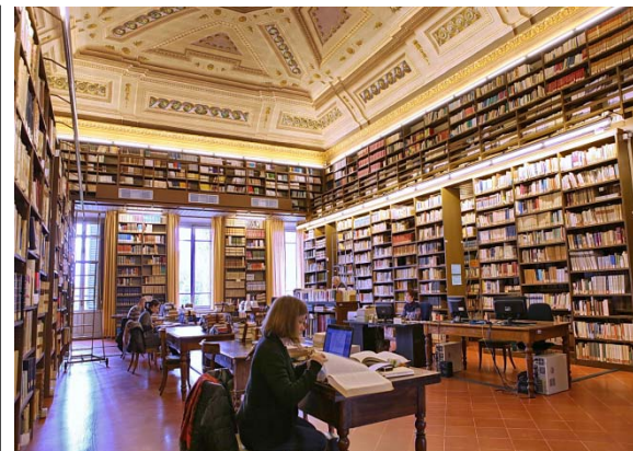
The Crusca Library with its 120,000 volumes on the linguistics and history of the Italian language

The garden is full of statues, hedges, plants, extraordinary potted citrus trees and fountains (the playful hydraulic systems created by Piero da San Casciano and Benedetto Varchi must have been amazing). It was commissioned and designed to celebrate the splendour and the power of the Prince, employing a magnificent and ingenious use of iconography and symbolism, as we can see with the symbolic map of Tuscany (Ammannati's "Appennino" statue at the top, the statues of the Mugnone river with Fiesole and the Arno, and the fountain of Venus-Fiorenza (now transferred to Villa della Petraia). Once the Medici family line had ended, the villa passed on to the new rulers, the Lorraines, then to the Savoys (who preferred Petraia) and finally to the Italian State in 1919. Nowadays, it is the permanent home of the Accademia della Crusca, the national institution founded in 1583 for the defence and study of the Italian language.