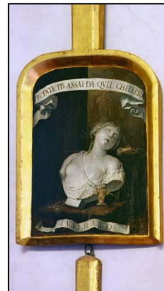
The Accademia's glazed shovel