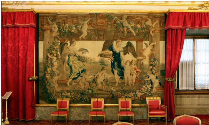
Part of the reception hall