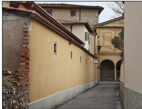
Via di Boldrone: to the left, part of the passageway connecting the Monastery with Villa La Quiete

When we arrive at No. 2, we find the Church and entrance of the beautiful Villa La Quiete alle Montalve (only open to the public on special occasions). This building is owned by the University of Florence, although it had long been the home of the Congregation of Montalve nuns, established as a religious order in 1939.