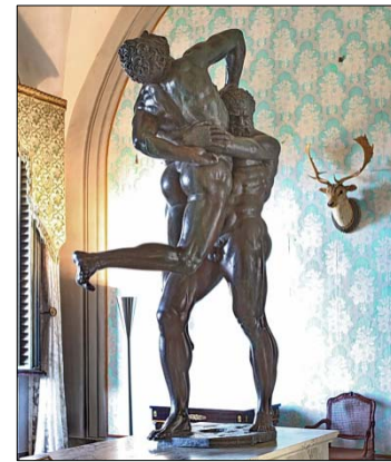
Hercules and Antaeus by Ammannati