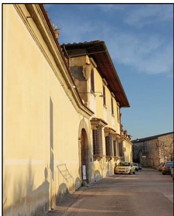
Villa Il Pozzino, the façade

This is a typical fifteenth-sixteenth century suburban villa with a beautiful loggia and courtyard.