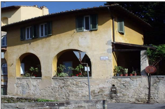
The Tatti Mill