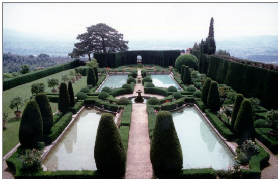
The Gardens of Villa Gamberaia