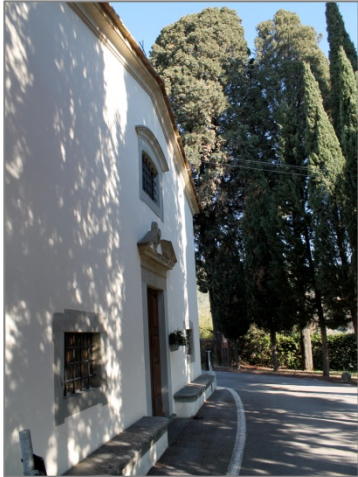
The oratory surrounded by cypresses

The road now continues as Via Desiderio da Settignano . This road passes in front of the Oratory of Vannella , providing beautiful panoramas and stunning views over the ancient villas.