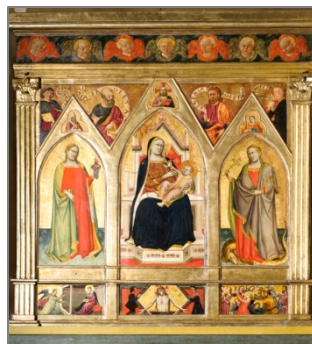
The triptych by Taddeo Gaddi