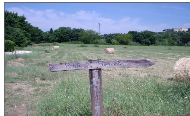
A handmade yet effective sign