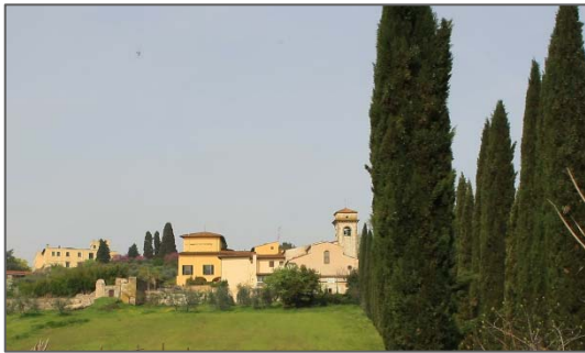
View of the Church of S. Martino

From Via Poggio Gherardo (a side street off Via Gabriele D'Annunzio) we continue uphill in the direction of Via San Martino a Mensola , where we can admire the Church of San Martino .