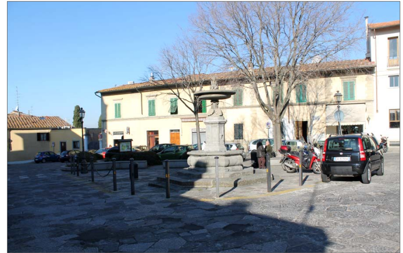
Piazza Niccolò Tommaseo