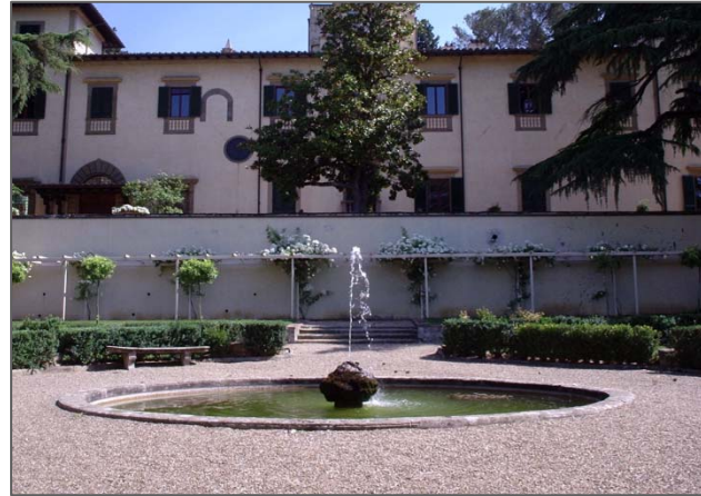
Villa Strozzi Sacrati