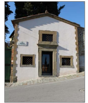
The Oratory of Carro

He found inspiration here for his poem "the Nymph", a tragic love story between the Nymph Mensola and the shepherd Africo. The village used to be home to miners and stonemasons, who worked in the nearby quarries at Trassinaia and Maiano. In the small square we find the Oratory of Madonna del Carro, now a private studio, which was probably built on the site of an existing tabernacle and dates back to 1695.