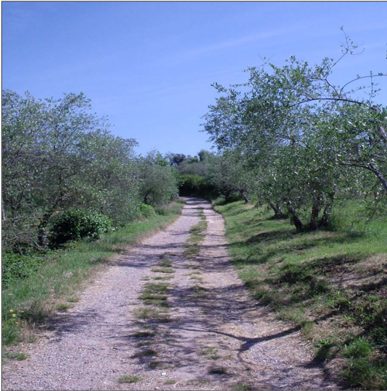
The country road towards the small bridge

We continue along this street which turns into a country road, passing the lemon house, until we reach a wooden signpost where we follow the sign towards Ponte a Mensola. We cross over the small wooden footbridge which stretches over the Mensola River and then stay on this road until we rejoin Via Gabriele D'Annunzio .