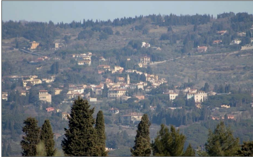
The view of Setignano with the S. Maria bell tower in the centre

At the end of Via Desiderio, we turn right heading down Via San Romano , crossing through the ancient village of Setignano. This once used to be a mining village where they extracted and worked the sandstone, and naturally it was involved in farming. It is also interesting to note that it was once part of the Municipality of Rovezzano. In the small square of Niccolò Tommaseo , we find the Church of Santa Maria a Setignano .