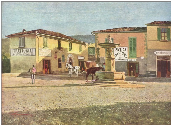
Telemaco Signorini, Setignano Square , 1880