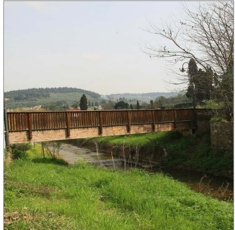
The small footbridge over the Mensola River