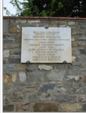
The illustrious foreign guests