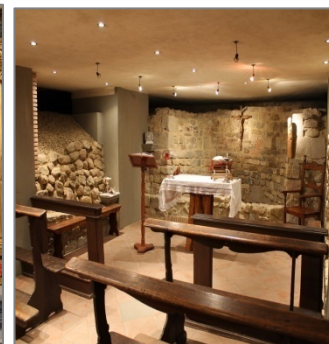
The underground chamber

Brunelleschi-style appearance, while the loggia and the oratory date back to the sixteenth century. The church contains many masterpieces, including the triptych by the Master of S. Martino a Mensola (on the high altar) entitled "La Vergine con Bambino e Santi" (1391), the triptych by Taddeo Gaddi (on the altar of St. Anthony) known as "Vergine col Bambino, S. Lucia e S. Margherita" (1360), as well as the altarpiece by Neri di Bicci (the altar of St Francis) called "Virgin with Child, John the Baptist, St. Francis, St. Magdalene and St. Clare".