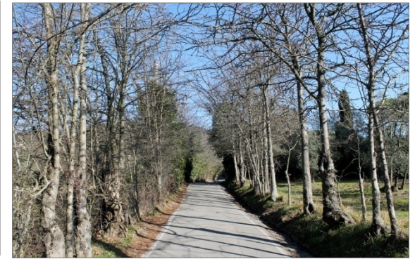
Via di Corbignano

In between rows of trees, fields, dry-stone walls and lower partitions, we climb up this beautiful road as it gradually gets steeper and steeper, until we reach the village of Corbignano (a recommended detour). We can wonder around this village by following the one-way street which opens out onto a panoramic square.