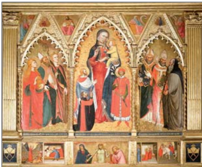
The Master of S. Martino a Mensola

This church was built over an existing oratory dedicated to St. Martin, the Bishop of Tours (you can see the remains of the apse and other artefacts underneath the church's floor). It was built by St. Andrew the Scot in the 9 th century, who was the first abbot in the monastery founded here. He lived and died here and his remains are kept in an untouched wooden coffin which was gilded in 1389. There is also a beautiful fourteenth-century reliquary bust of him. The renovations of 1451 and 1452 gave the church its current Renaissance,