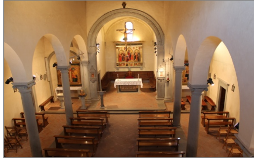
Interior of the Church