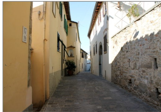
A road in the village of Corbignano

The origins of this village date back to the ancient Roman site belonging to the Corvini family (hence Corbignano), which was located on an important branch of the old Via Cassia. Boccaccio used to live here at No. 10 (and may have been born here), which is now just the remains of his father's house and a private home.