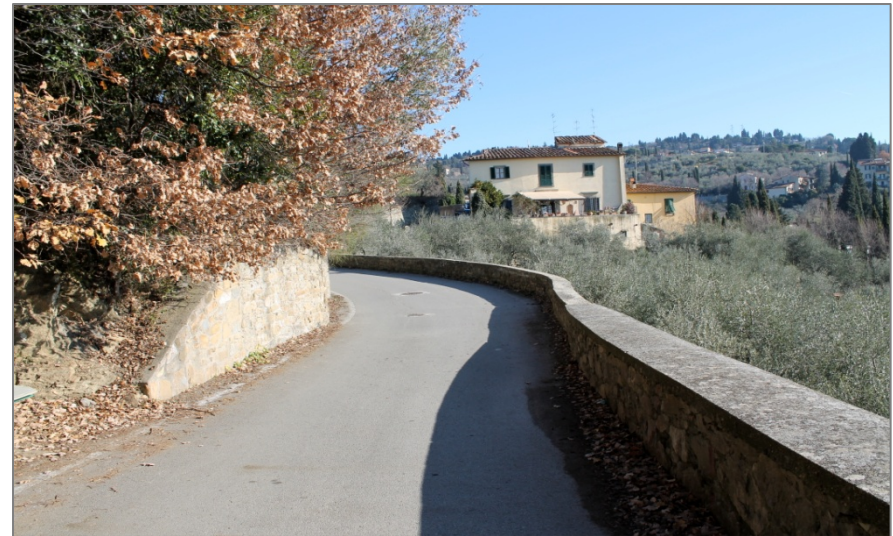
Via Desiderio da Settignano