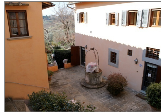
Houses in the village