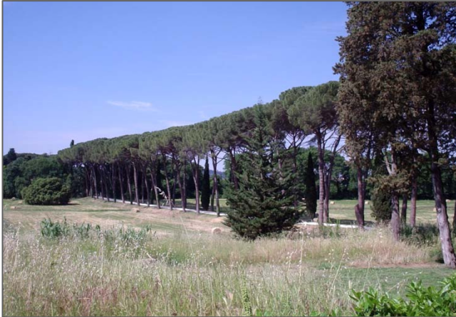
The driveway to Villa Strozzi Sacrati

Walking by the side of the church, we continue along until we take a left down Via della Capponcina (sloping downhill). At No. 32 we find the home of the poet, Gabriele D'Annunzio, who lived here between 1898 and 1910. This house was also the scene of his torrid love affair with Eleonora Duse. We then take right, heading down Via Madonna delle Grazie . This narrow walled road leads down into the valley but then opens out with a panoramic view over the fields and pine forests at the foot of the hills. Here we find the beautiful Villa Strozzi Sacrati .