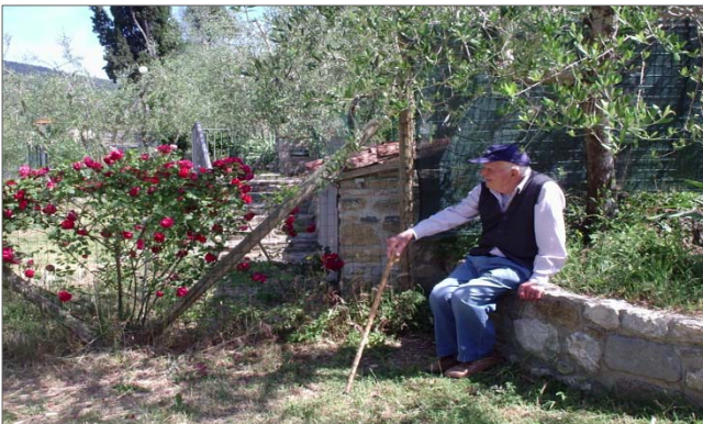
The historical memory of the area