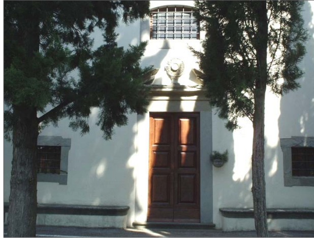
Part of the façade