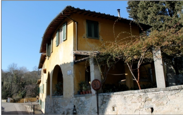
The Tatti Mill, taking its name from the nearby Villa

At the end of Via San Martino a Mensola (featuring the beautiful, charming Tatti Mill) we head to our right onto Via di Vincigliata . We then take another right, heading down Via di Corbignano . At the beginning of this road, we find two stone inscriptions in memory of the famous people who were born, lived, worked and stayed here. This area was much-loved by artists, writers, art critics and even painters (even though none are named on the inscriptions, the Macchiaioli painters often drew the landscapes around these hills).