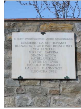
The great Italian artists