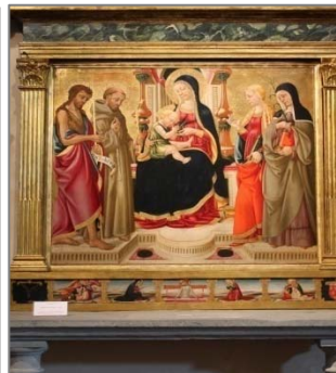
The altarpiece by Neri di Bicci