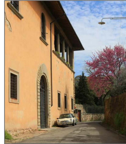
Villa dello Strozzino

Villa dello Strozzino Attributed to Simone del Pollaiuolo, this villa features a unique series of half-moon decorations along the façade, which were added in the 16 th century. The half-moon was the symbol of the Strozzi family, which also gives this villa its other name: Villa delle Lune ('luna' means moon in Italian).