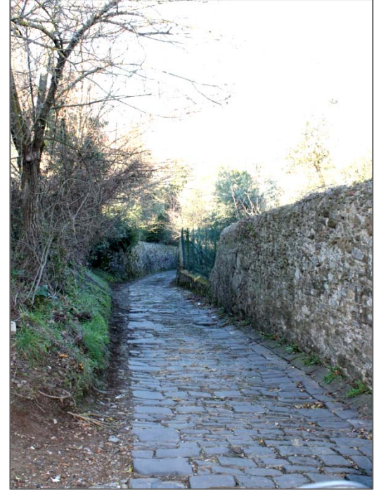
A paved section of Via di S. Vito

The foundations of this building date back centuries (it may have belonged to the Knights of the Holy Sepulchre of Jerusalem). It was then named after St. Vitus and St. Modestus, who were worshiped in Tuscany from the 11 th century. It features a late fifteenth-century loggia at the front, although due to the different restoration work it has undergone over the years, it now retains prevailing nineteenth-century features. It contains many memorable objects, including a chalice donated in thanks by Grand Duke Leopold II after he walked away unharmed from a carriage accident on the nearby Via di Bellosguardo.