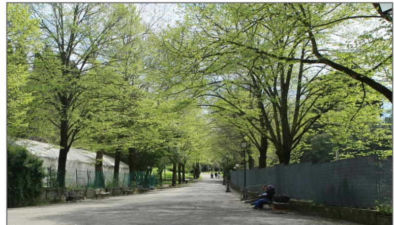
Inside the Park