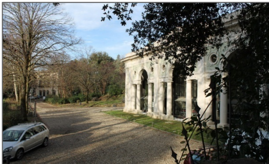
The Lemon house