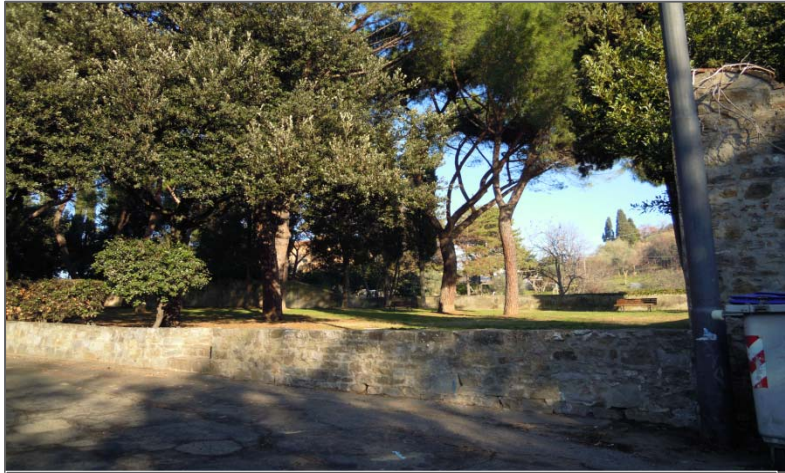
Prato dello Strozzino

When we reach Prato dello Strozzino, we turn left from this park onto Via di San Vito , where we see the towering fifteenth-century Villa dello Strozzino (not open to the public).