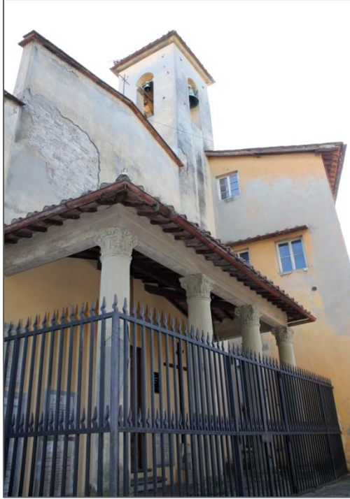
The Church of San Vito e Modesto

Once we've passed a small charming little village, we come to the Church of Santi Vito e Modesto .