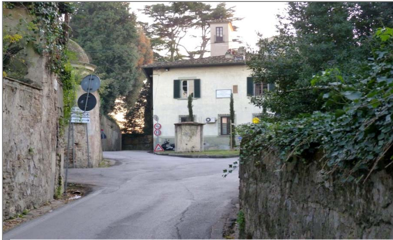
A glimpse of Piazzetta di Bellosguardo

We continue along Via di San Carlo until we reach Piazzetta di Bellosguardo , where we then take Via di Bellosguardo towards the centre of Florence. On our right we come to Via Roti Michelozzi (a recommended detour to enjoy an unrivalled and unique view of Florence's landmarks). On our right along Via di Bellosguardo, we come to Villa La Limonaia (a beautiful panorama over Florence opens up at the end of this property) and on the other side we see Villa Brichieri Colombi (not open to the public).