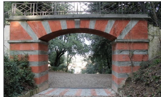
The small connection bridge