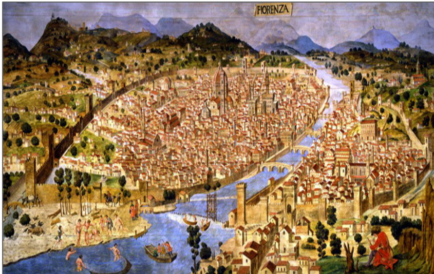
The “Veduta della Catena” from 1472 and the Church of San Bartolomeo a Monte Oliveto

The Church of San Bartolomeo a Monte Oliveto dominates this hillside. In 1472, Francesco Rosselli painted the “Veduta della Catena” (the Chain Map) from the top of this hill, which was the first full view of Florence from the times of Lorenzo the Magnificent. The Church of San Bartolomeo is part of the former monastery complex founded in 1334 by a monk from the Benedictine Abbey of Monte Oliveto Maggiore (located in Chiusure, in the region of Crete Senesi). It was expanded after it received donations of land and then reconstructed in 1454, when it took on the Michelozzo forms that we see today. It was renovated several times in 1725 and 1955. Inside it has one single nave, featuring the fresco and sinopia of the “Last Supper” by ‘Il Sodoma’, several frescoes by Poccetti and a series of important paintings from the late sixteenth and seventeenth centuries (“Cristo e la Emorroissa” by ‘il Poppi’, “The Entry of Christ into Jerusalem” by Santi di Tito, and the “Assumption of Mary” by Passignano, among many others).